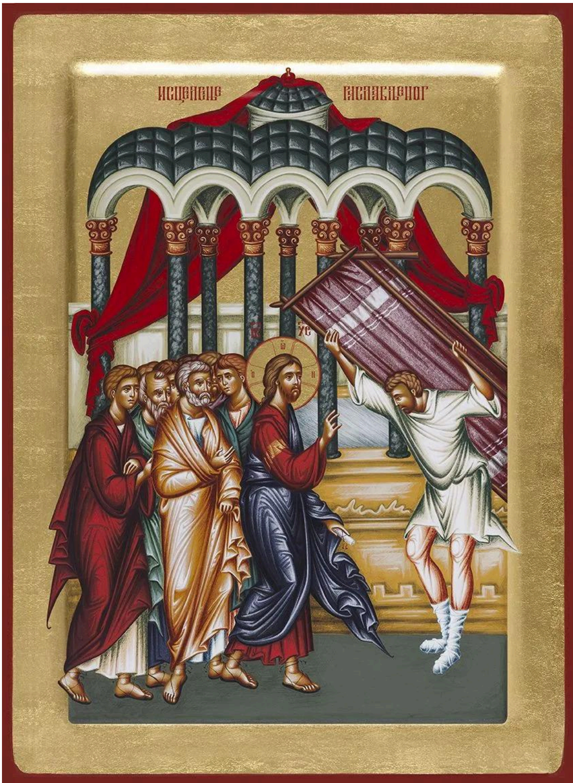
Healing the Paralytic at Capernaum

A Service of Healing & Restoration March 22, 2026 | 10:00 AM