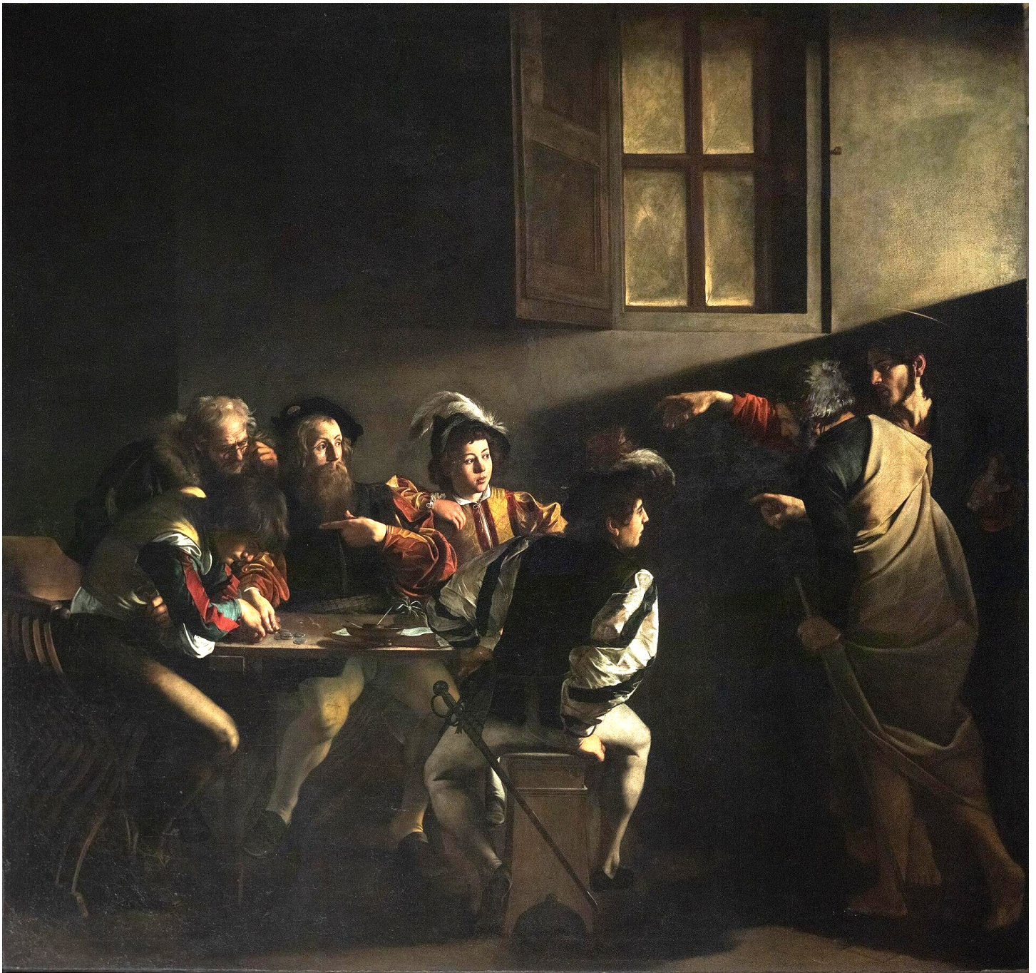
The Calling of St. Matthew (1600) by Caravaggio

Second Sunday after Pentecost June 7, 2026 | 9 AM