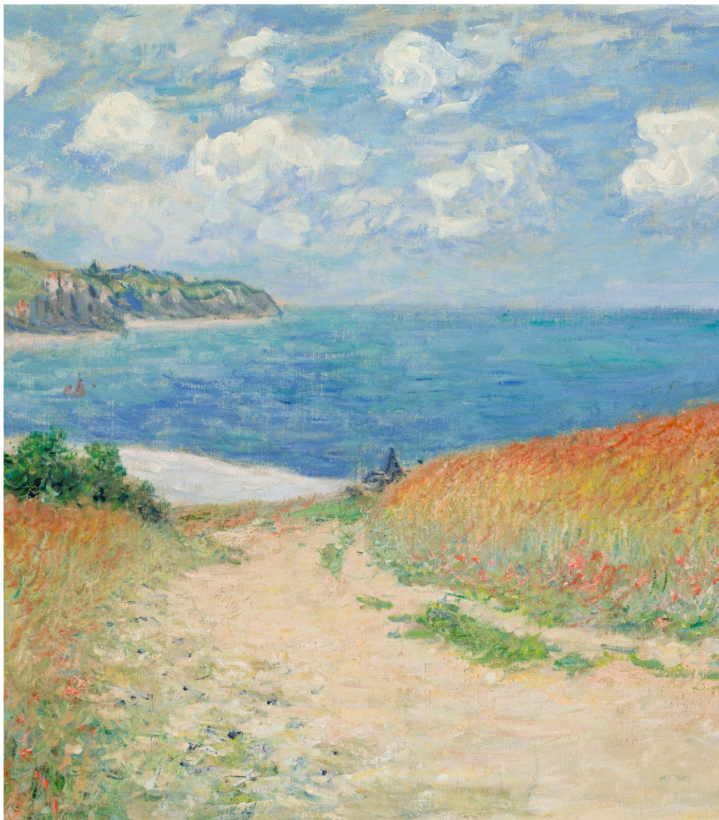
Path in the Wheat Fields at Pourville (1882) by Claude Monet

Ascension & Consecration Sunday May 17, 2026 | 10:00 AM